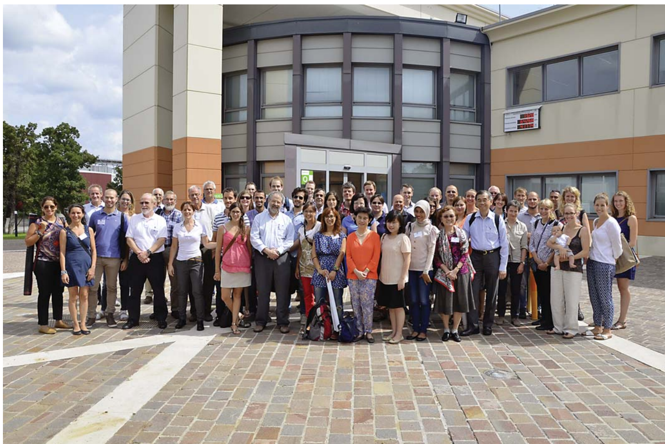
Fig. 1. The DOTYR-15 attendees.

largely preventable if severe hyperbilirubinemia is identified early and treated promptly with effective phototherapy or, for hazardous cases, exchange transfusion. Guidelines for managing jaundice have been proposed by the American Association of Pediatrics (AAP), the UK National Institute for Health and Care Excellence (NICE) and others [8–20].